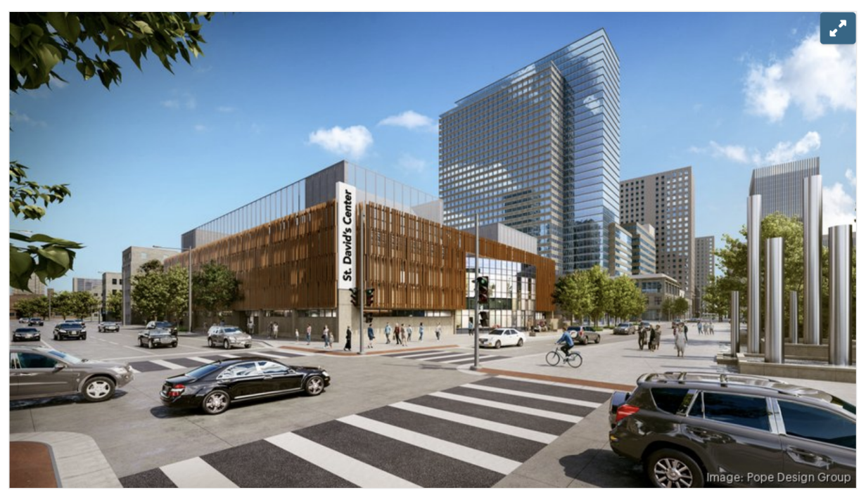
St. David's Center is building out its facility at the former YWCA Minneapolis location along Nicollet Mall in downtown Minneapolis.